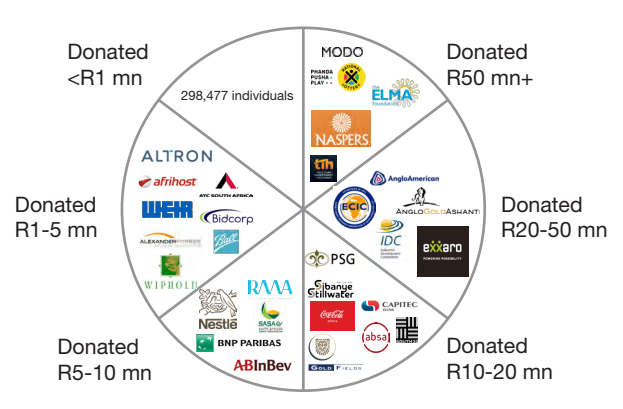
Figure 3: Overview of donors to the Solidarity Fund, South Africa

<sup>175</sup> Devex: Funding the response to COVID-19