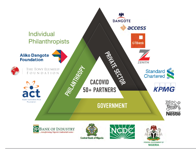
<sup>101</sup> Worldometer: Corona Virus Cases by country

CACOVID has demonstrated how immense network power, bringing together multiple stakeholders, can be leveraged to address social challenges at scale. Yet, like in previous disasters, the collaboration may not be sustained once the pandemic is eradicated as stakeholders usually go back to delivering on their objectives.